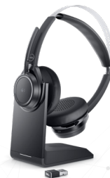
Premier Wireless ANC Headset - WL7022

Multi-task seamlessly across 3 devices with this premium full-size keyboard and sculpted mouse combo featuring programmable shortcuts and 36 months battery life. 36