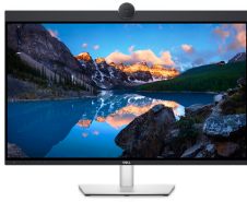
Dell UltraSharp 32 4K Video Conferencing Monitor - U3223QZ

Connect like you're there on this advanced video conferencing monitor featuring an intelligent 4K webcam and experience incredible color and contrast with groundbreaking IPS Black panel technology.