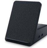
Dell Dual Charge Dock - HD22Q

Elevate your video conferencing experience on this powerful, intelligent 4K webcam 34 that optimizes your visuals with a large 4K Sony STARVIS™ CMOS sensor and AI Auto-Framing.