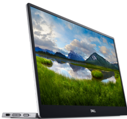
14" Portable Monitor - C1422H

Write naturally and create with precision with a rechargeable premium active pen featuring up to 40 days battery life on a single charge 35 and a Tile location function for complete peace of mind.